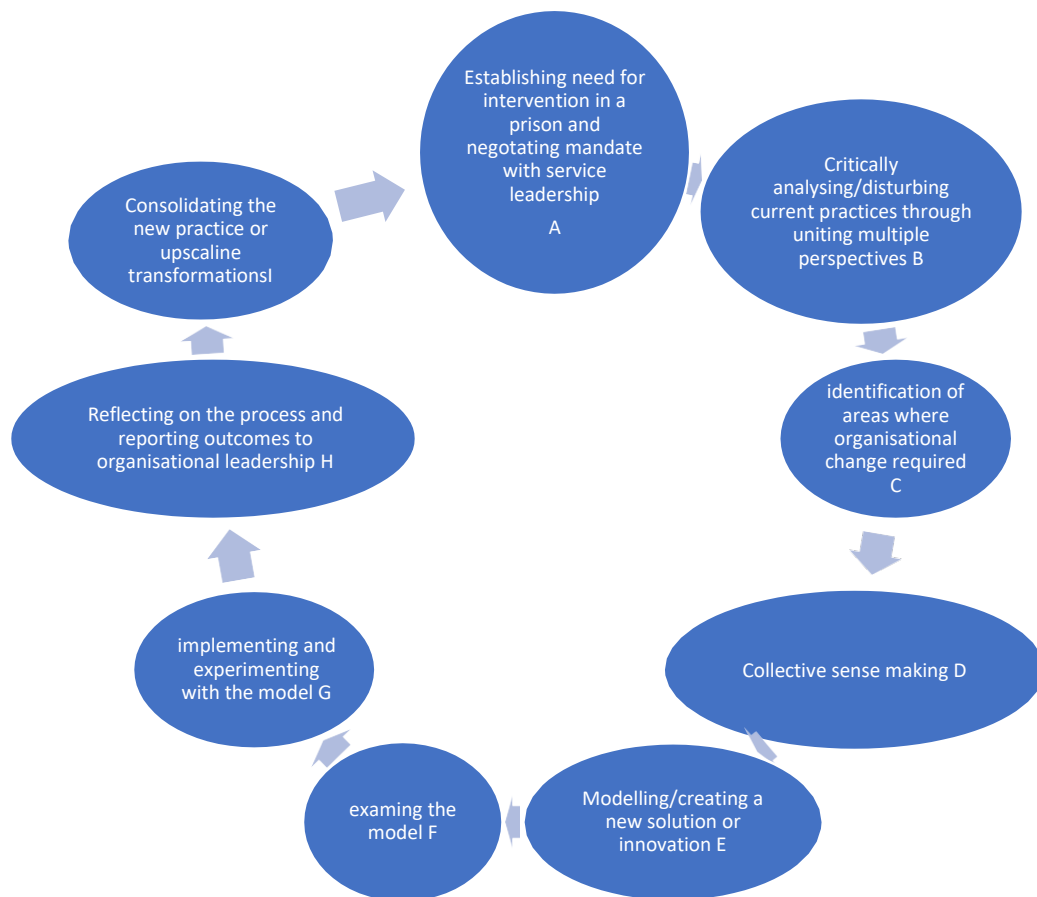
Figure 3 Expansive learning cycle capturing collaborative learning within the CL model (adapted from Engeström 1987,1999, 2004)